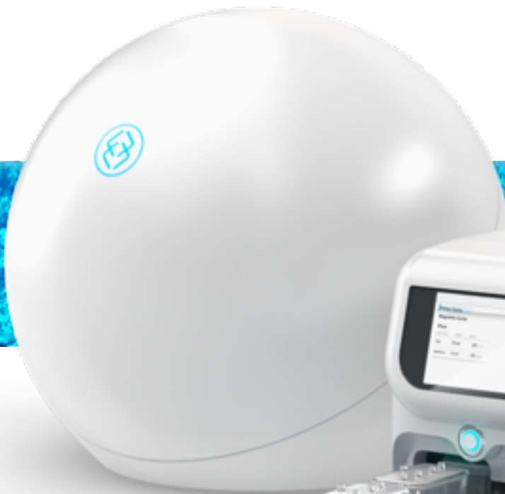
Orb Hub Module