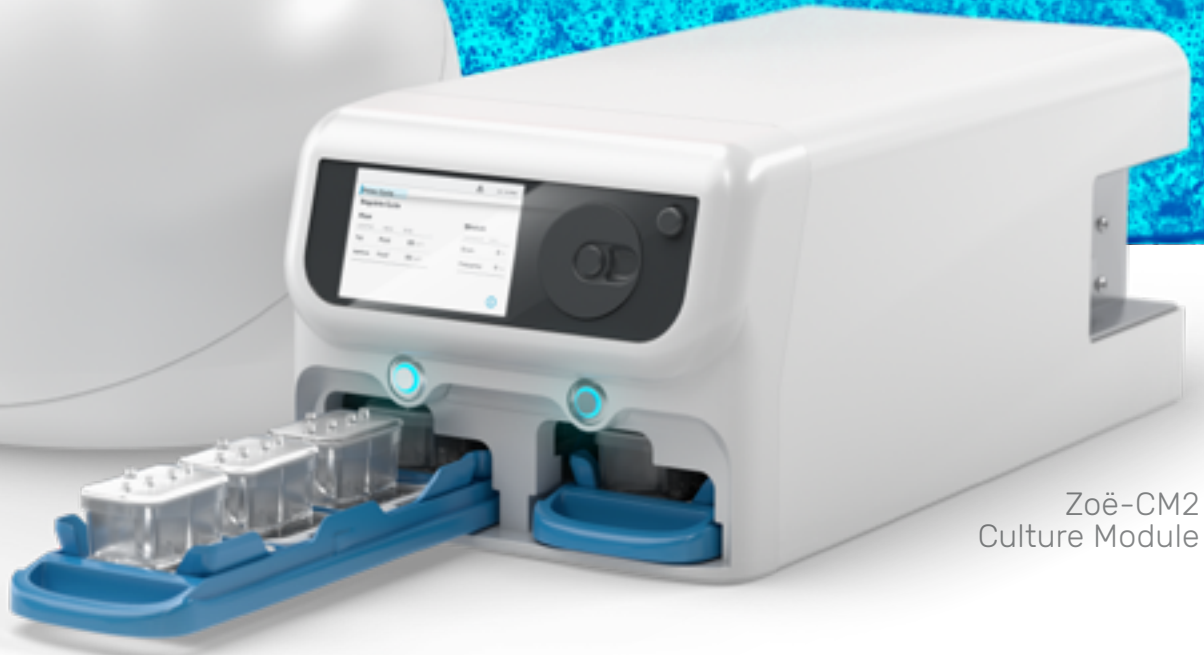
Zoë-CM2 Culture Module