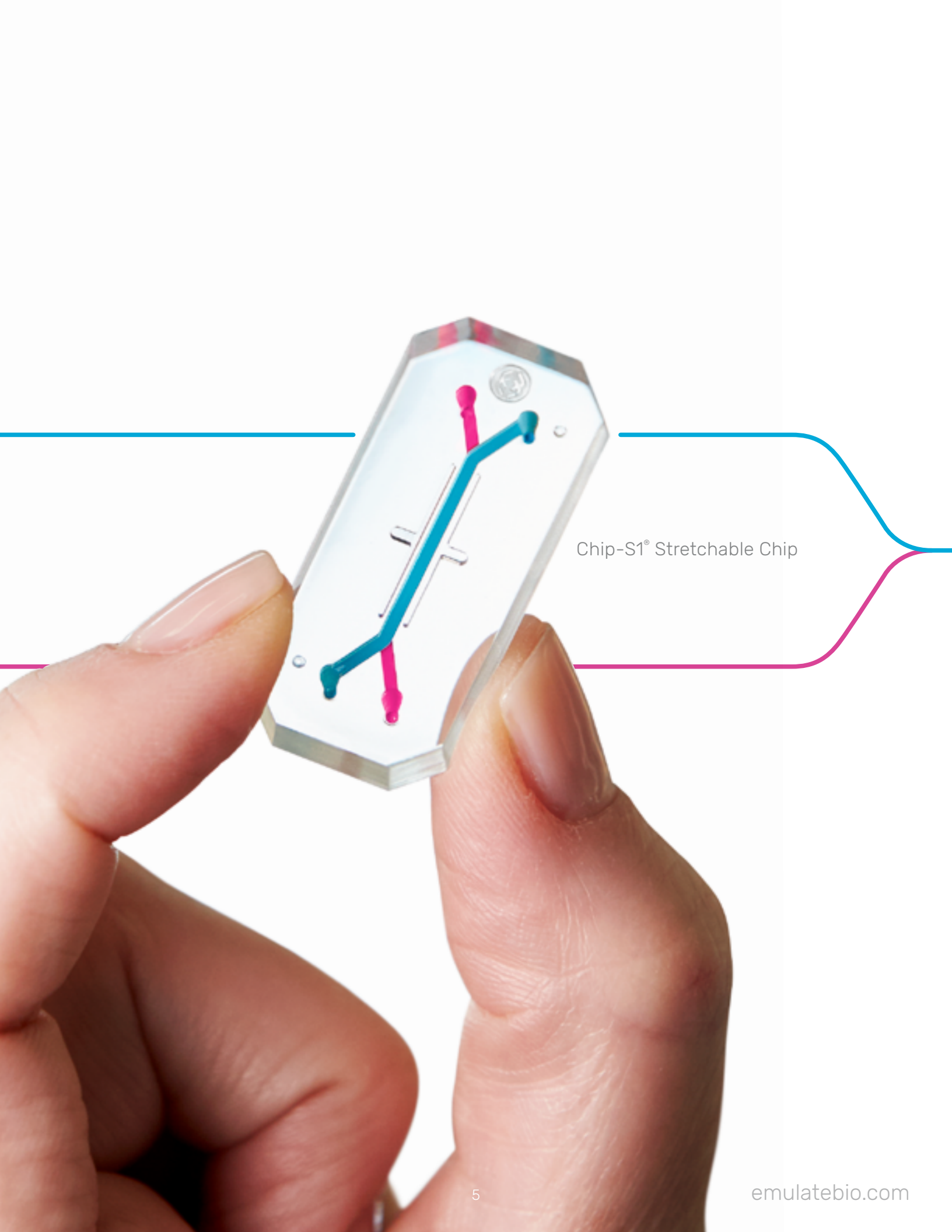
Chip-S1® Stretchable Chip