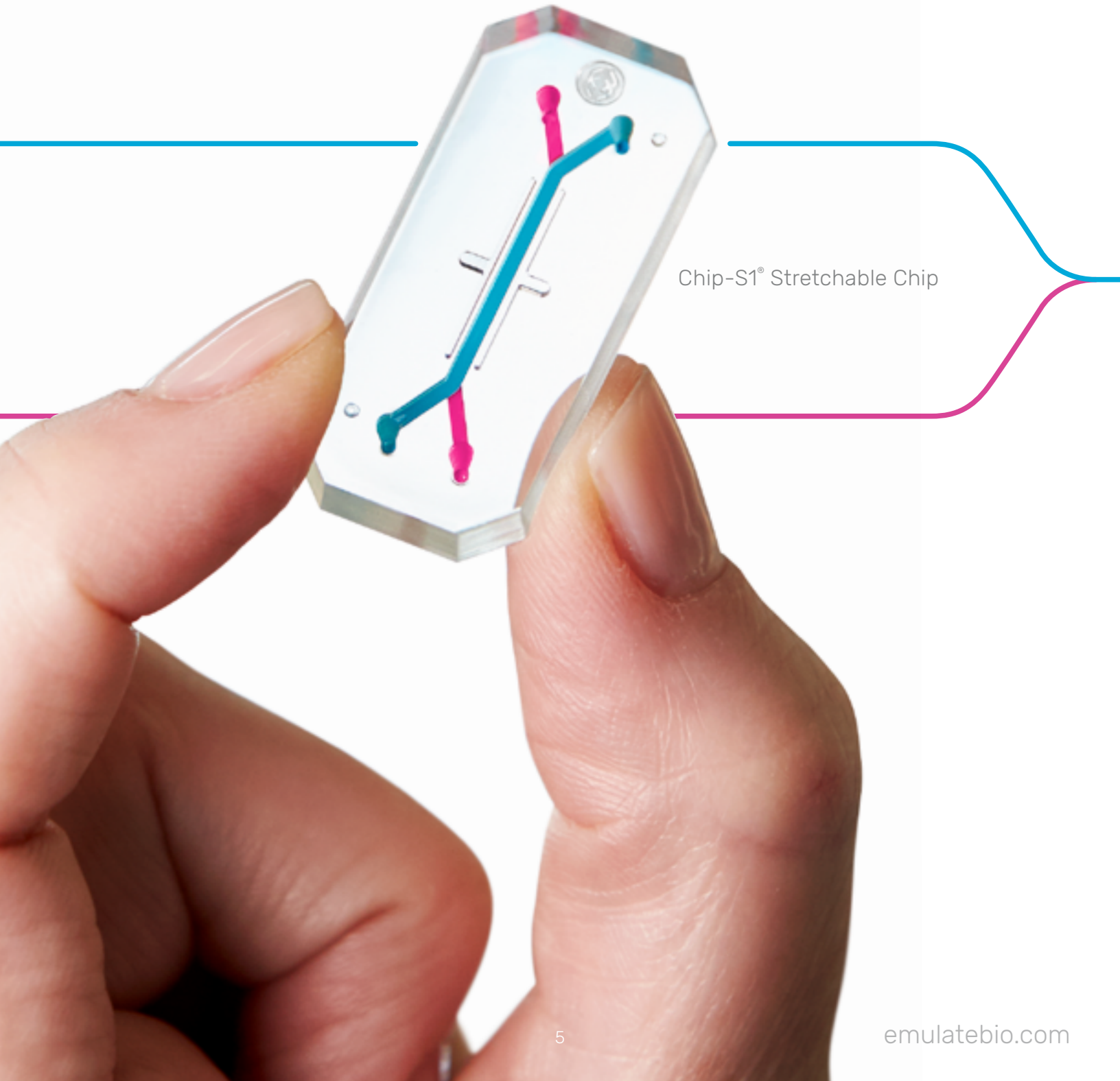
Chip-S1® Stretchable Chip